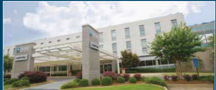
Marshall Medical Center South 2505 US Highway 431 • Boaz, Alabama 35957

Reach either location by calling 256.571.8925 (256.753.8925 for Arab area residents).