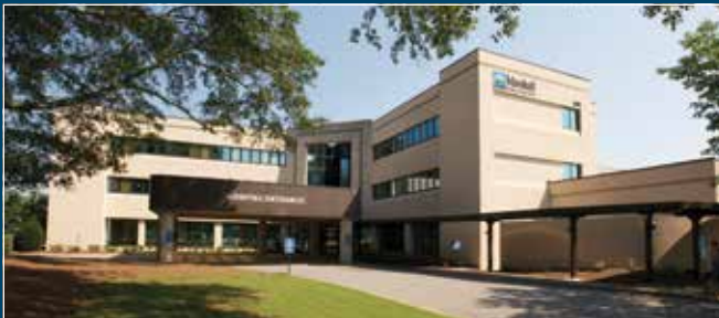
Marshall Medical Center North 8000 Alabama Highway 69 • Guntersville, Alabama 35976

Marshall Medical delivers comprehensive, quality healthcare services close to home. For more details visit mmcenters.com .