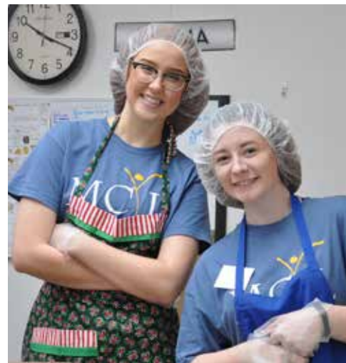
Marshall County Youth Leadership

Marshall Sports Medicine - Certified Athletic Trainers employed by Marshall Medical work on high school campuses and at Snead State Community College in Marshall County to provide young athletes with consistent, quality care related to their sports activities. The education and experience of the TherapyPlus athletic training team ensures the community is getting the highest level of service available in this area.