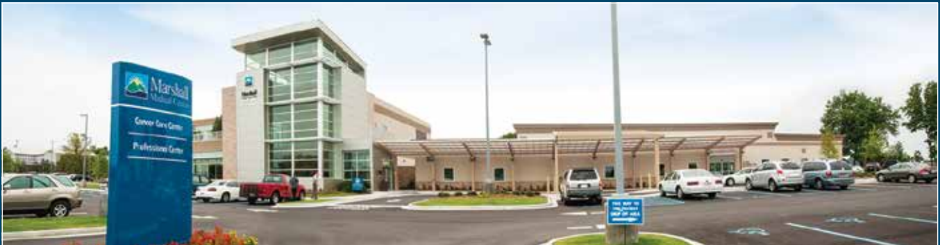
Marshall Cancer Care Center (left) and the Marshall Professional Center (right) are located just south of Cracker Barrel in Guntersville. The street address is 11491 US Highway 431, Albertville, AL 35950.

Reach either location by calling 256.571.8925 (256.753.8925 for Arab area residents).