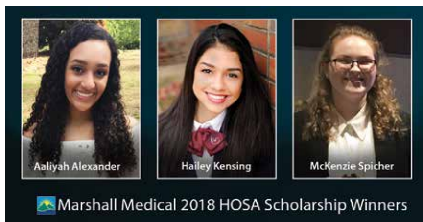
HOSA-Future Health Professionals