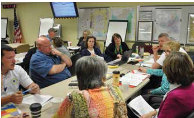
Marshall Medical staff shown during the "Cold Mountain" emergency drill which tested the hospitals' plans for a paralyzing snow and ice event.

The Joint Commission requires hospitals to activate their Emergency Operations Plan twice a year, and at least one should include participation in a community-wide exercise.