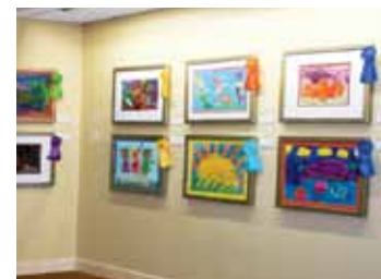
INSPIRE is a Youth Art Contest held in celebration of Youth Art Month.

Personal and Financial Support Programs for the Cancer Care Center at Marshall Medical Center South.