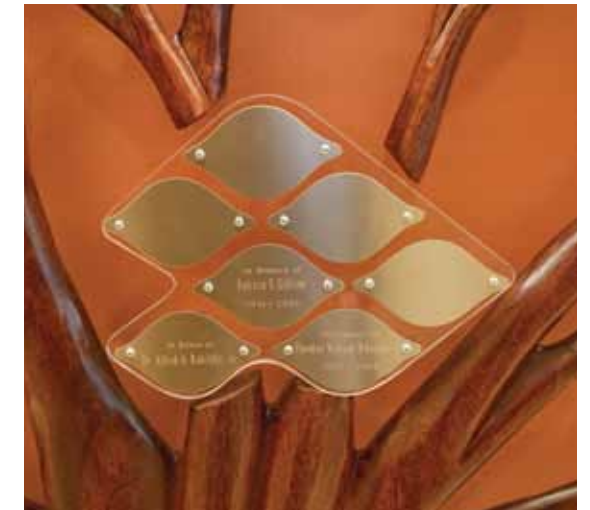
The Giving Trees are original bronze sculptures located at both hospital campuses. Anyone may purchase an individually-inscribed leaf or stone at the base of the tree in honor of a loved one.

For more information, please call The Foundation office at 256-571-8026. Your donations may be mailed to The Foundation for Marshall Medical Centers, Post Office Box 855, Guntersville, AL 35976 - or - to give your gift in person you may visit the Administration Office at either Marshall Medical Center North or Marshall Medical Center South.